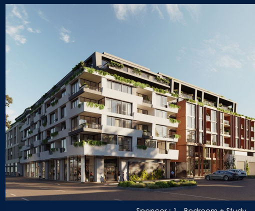
Spencer: 1 - Bedroom + Study