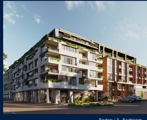
Roden: 3 - Bedroom