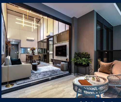
3 - Bedroom Premium