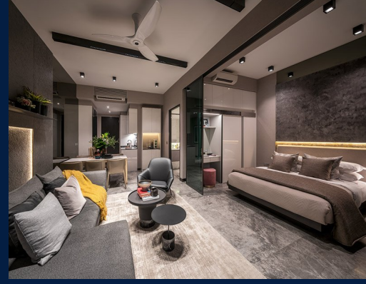
1 - Bedroom